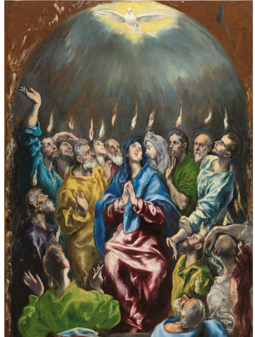
"Pentecost" (ca.1600) – El Greco (1541-1614)

THE ANGLO-CATHOLIC PARISH IN THE DIOCESE OF OTTAWA CELEBRATING 130 YEARS OF WORSHIP AND SERVICE, 1889-2019