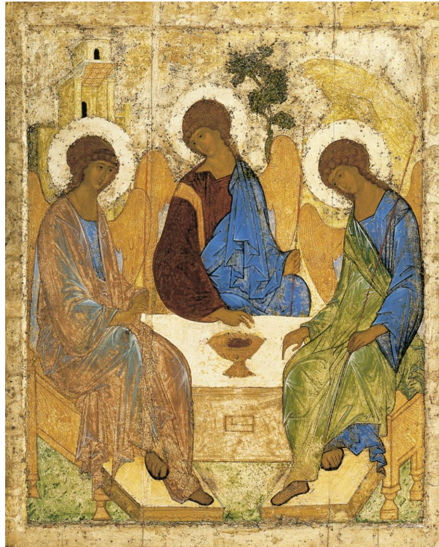
"The Trinity" (1411 or 1425-27) – Andrei Rublev (1360's-1427/30)

THE ANGLO-CATHOLIC PARISH IN THE DIOCESE OF OTTAWA CELEBRATING 130 YEARS OF WORSHIP AND SERVICE, 1889-2019