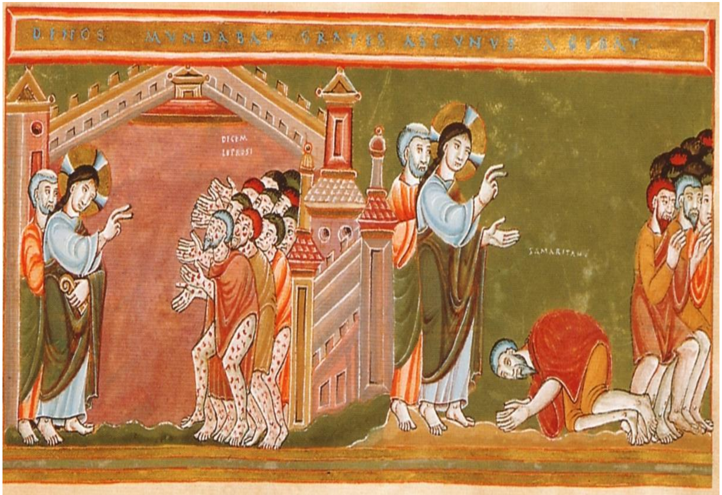
The Parable of The Healing of the Ten Lepers, Codex Aureus of Echternach, c. 1030-1050.