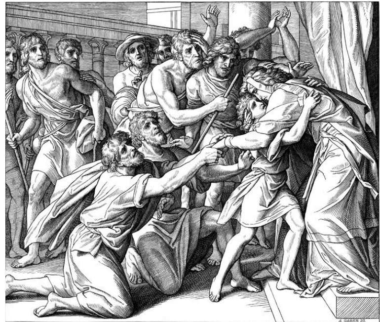
“Joseph Revealed” (1853) - Julius Schnorr von Carolsfeld (1794-1872)

THE ANGLO-CATHOLIC PARISH IN THE DIOCESE OF OTTAWA CELEBRATING 130 YEARS OF WORSHIP AND SERVICE, 1889-2019