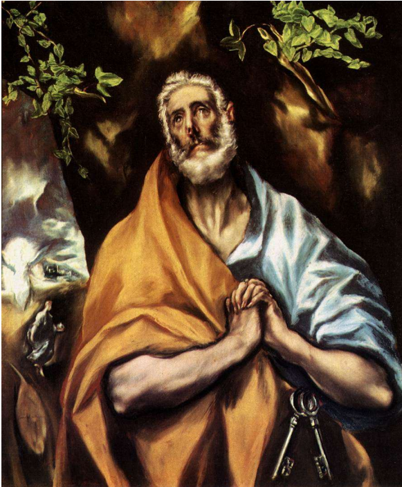
St Peter in Penitence , El Greco (1541-1614)