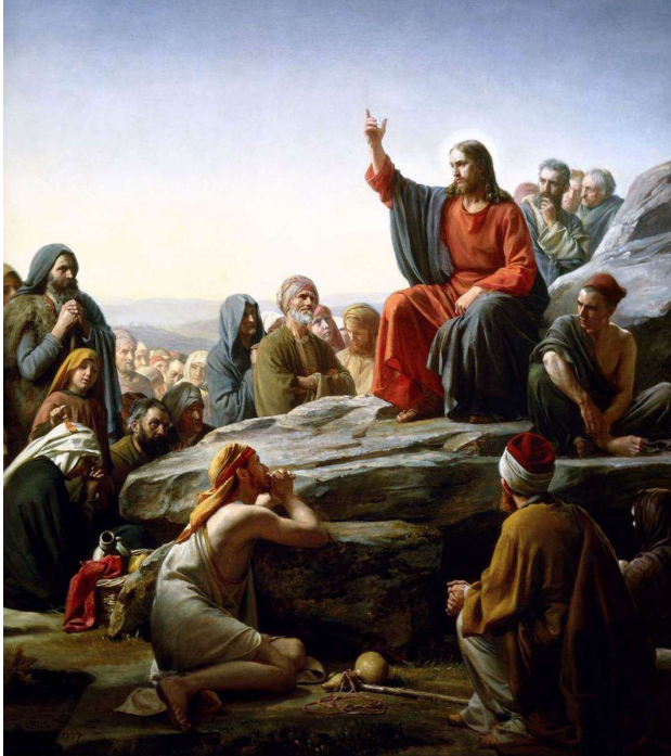
The Sermon on the Mount, Carl Heinrich Bloch (1834-1890)