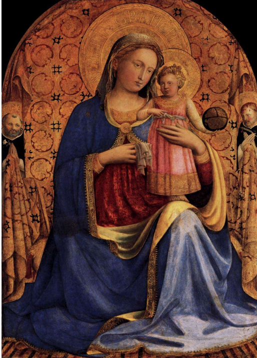
Madonna and Child, Fra Angelico (c.1400-1455)