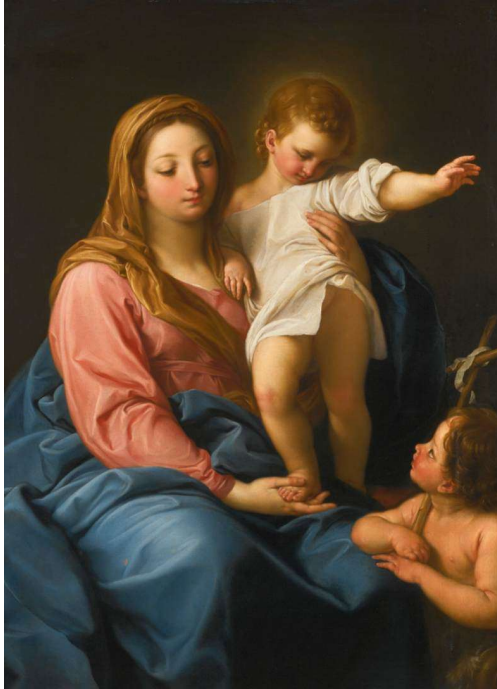
Virgin and Child with the Infant St John the Baptist, Pompeo Batoni (1708-1787)