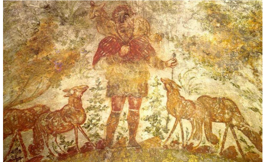
Christ the Good Shepherd, 3rd century - Catacomb of Domatilla, Rome