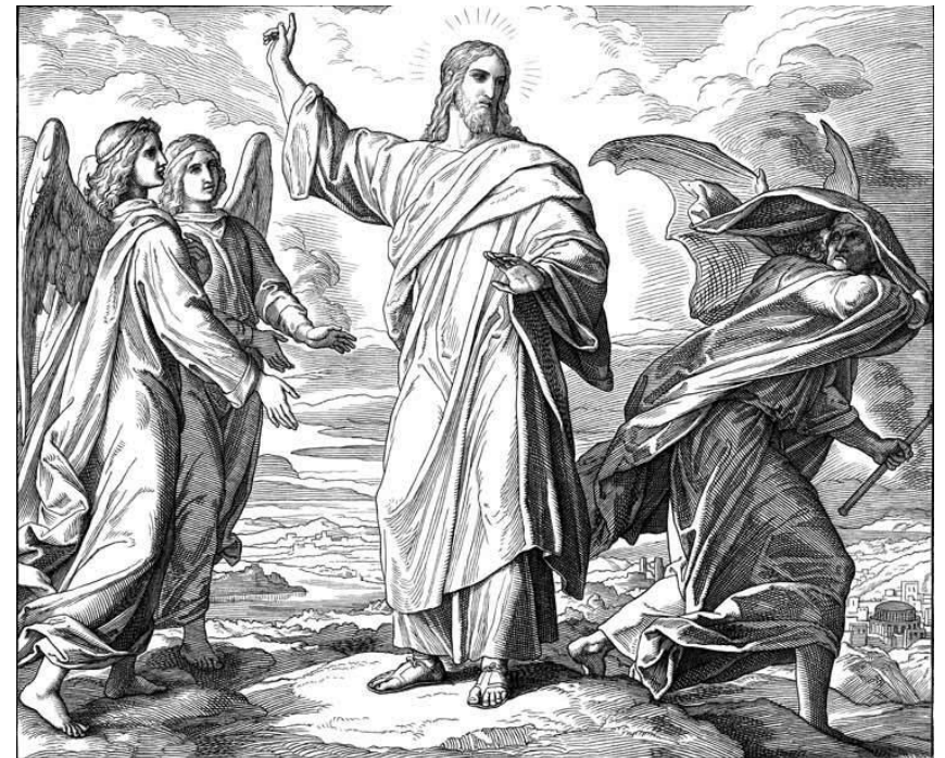
“Temptation of Christ” (1860) - Julius Schnorr von Carolsfeld (1794-1872)

THE ANGLO-CATHOLIC PARISH IN THE DIOCESE OF OTTAWA CELEBRATING 130 YEARS OF WORSHIP AND SERVICE, 1889-2019