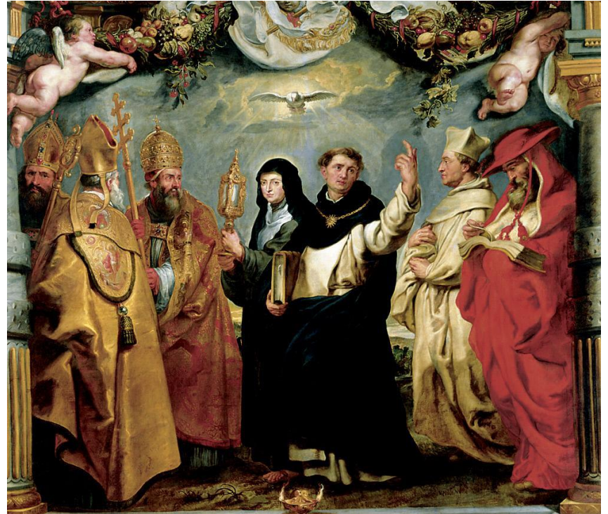
"The Defenders of the Eucharist" (c.1625) – Peter Paul Rubens (1577-1640)

THE ANGLO-CATHOLIC PARISH IN THE DIOCESE OF OTTAWA CELEBRATING 130 YEARS OF WORSHIP AND SERVICE, 1889-2019